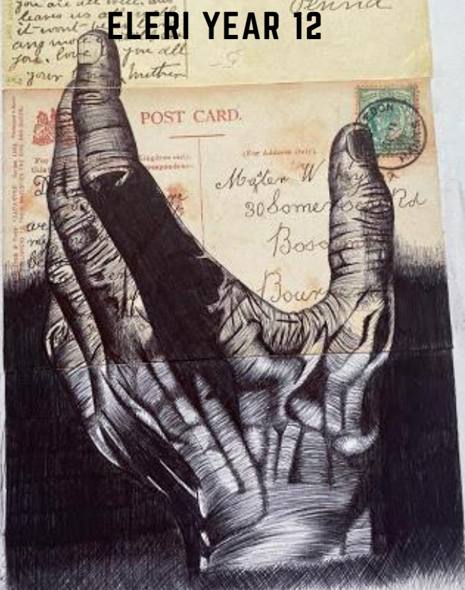
ELERI YEAR 12