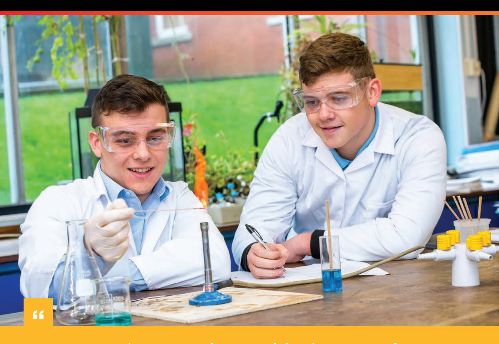
Learning together, achieving together.